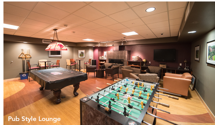
Pub Style Lounge