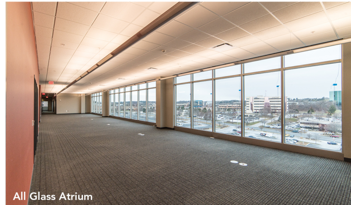
All Glass Atrium