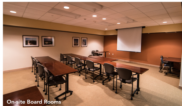
On-site Board Rooms